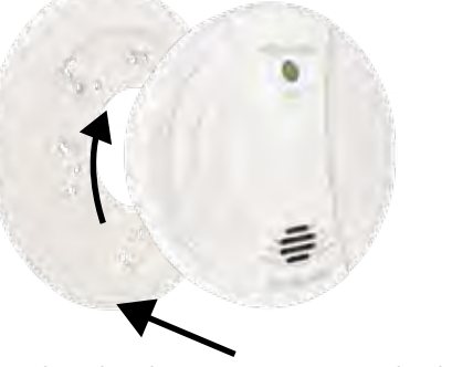
Simply push and rotate BESMOKEY4 Smoke Alarm into place

Detector needs to have base wired prior to installing skirt