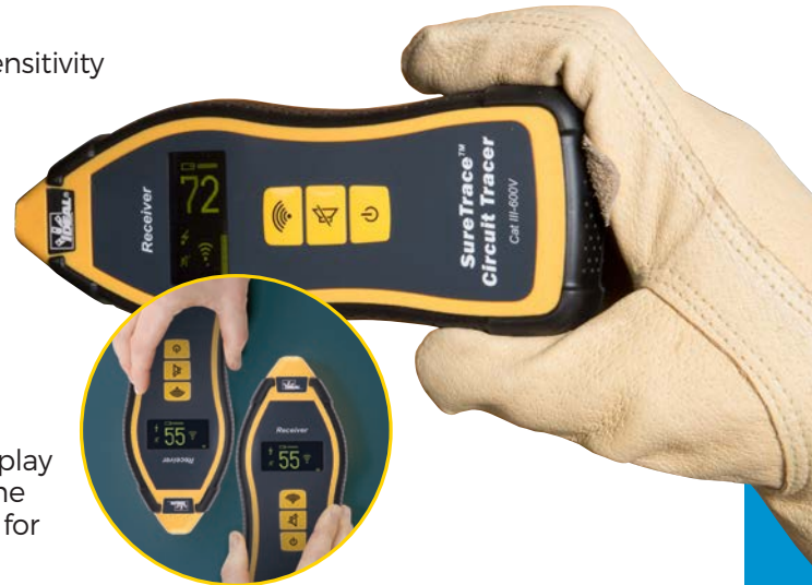
Exclusive Rotating Display