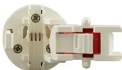
SMS1_IQF Top View