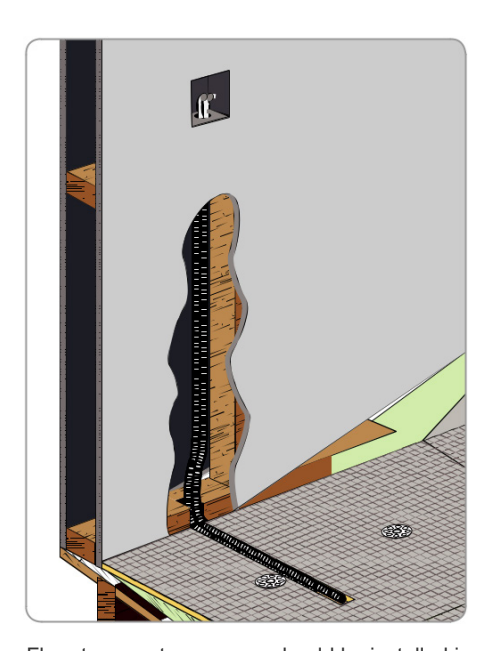
Floor temperature sensor should be installed in a conduit, within a clear area of the floor, and away from any other temperature influences.

Manually boost your underfloor heating and towel rail until the next heating event or for 1, 2 or 4 hours